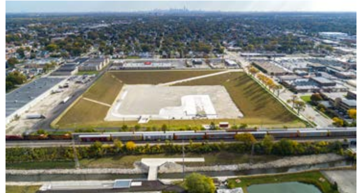
The Addison Creek Reservoir provides 195 million gallons of storage capacity and connects with the Addison Creek Channel (at bottom). Photo taken October 2022.

Several entities were involved during the planning of the project. The MWRD worked closely on the design of the reservoir and channel improvements with Northlake, Melrose Park, Stone Park, Bellwood, Westchester, Broadview, the Illinois Department of Transportation, various railroads and several utility companies. The MWRD was required to obtain permits and approvals from the Illinois Department of Natural Resources Office of Water Resources, the Illinois Environmental Protection Agency, the United States Army Corps of Engineers, Soil and Water Con-